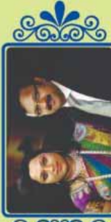
Chairman & Managing Director

B.Arch. CET CODE : E 243 | COMEDK: E174 | COA : KA-35