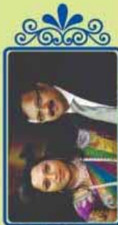
Chairman & Managing Director

B.Arch. CET CODE : E 243 | COMEDK: E174 | COA : KA-35