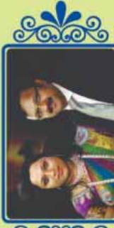
Chairman & Managing Director

CET CODE : E 243 | COMEDK: E174 | COA : KA-35