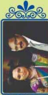
Chairman & Managing Director

CET CODE : E 243 | COMEDK: E174 | COA : KA-35